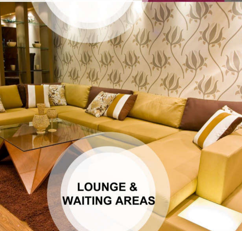
LOUNGE & WAITING AREAS